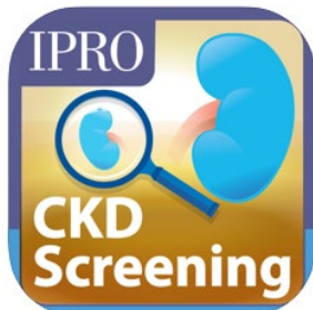
CKD - Screening 12+ Island Peer Review Organization, Inc Free

An aide to assist clinicians in diagnosing Chronic Kidney Disease(CKD).