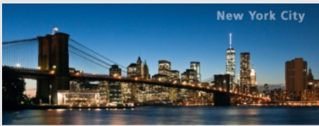
New York City